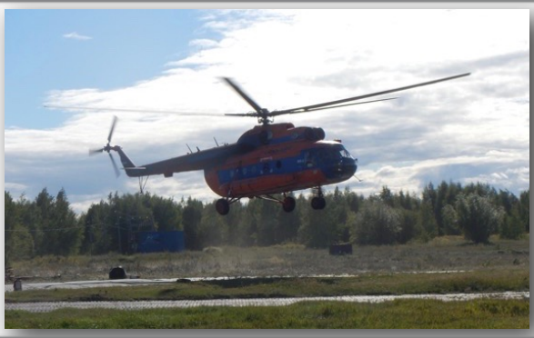
Another view of the Soviet MI-8 used on the trip