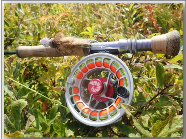
This is a mouse, tube fly, that was very effective