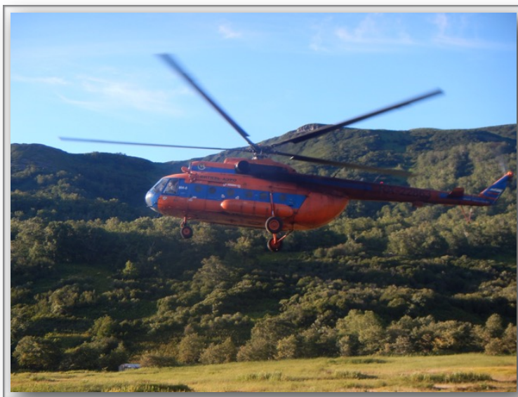
Part of the trip was on a Soviet MI-8