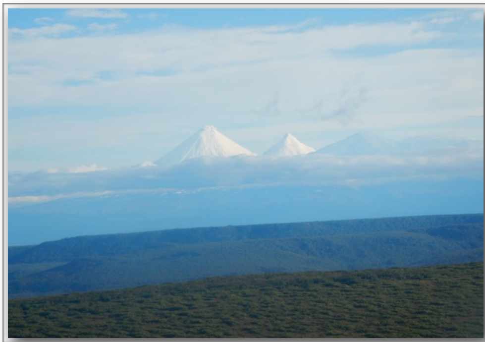
The Kamchatka Peninsula has many dormant volcanos