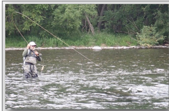
Mel hooked up to one of numerous cobos