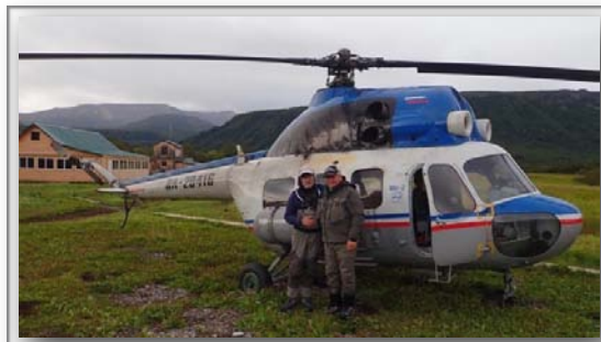
This was our helicopter for the week