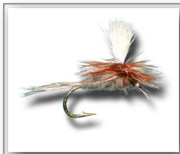
Parachute Adams from Fly Shack web site

Hackle: Brown and Grizzly Hackle, Tied Parachute Style