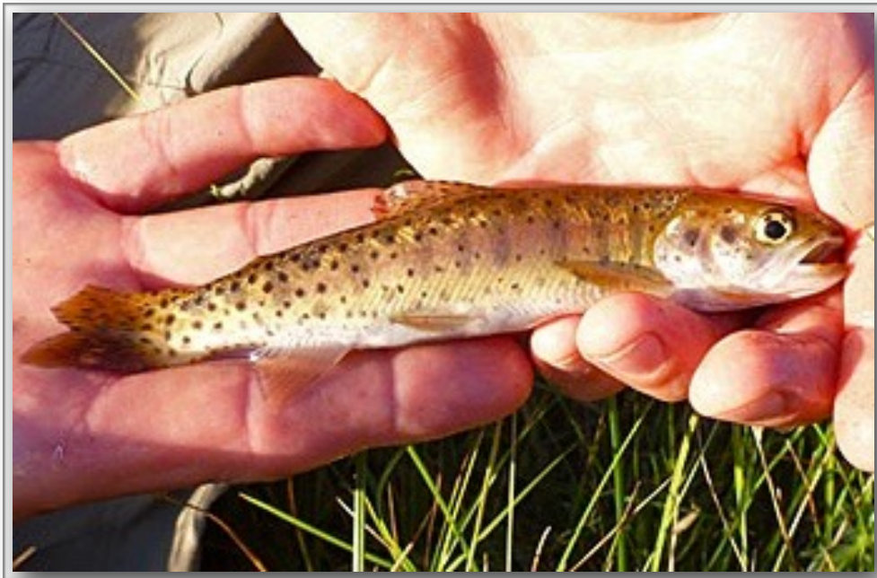
2018 Lahontan Cutthroat Trout

Treasurer, Southwest Council FFI, 1213 Sunset Place, Ojai, Ca 93023