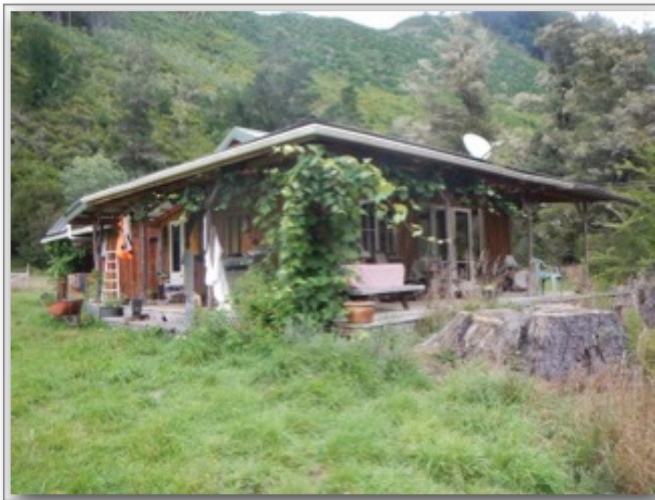
Baton River Rancher's cabin. "We stopped to ask if we could fish their section of the river and they said we could camp there and use their toilet. Extremely friendly and welcoming."

If you have ever wanted to fish New Zealand, or even if you haven't, don't miss our March program. There will be something for everyone - beautiful photos of incredible scenery, enough large fish stories and photos to fill a catalogue, travel tips, and suggestions on how to be successful fishing one of the most beautiful destinations you will ever find. March 13, 2018, 6:00 p.m., St. Augustine By-the-Sea. Make your reservations now.